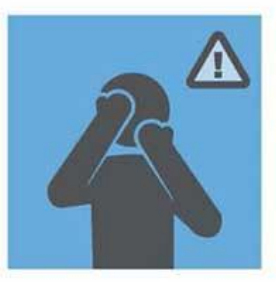
AVOID TOUCHING YOUR EYES, NOSE, OR MOUTH WITH UNWASHED HANDS OR AFTER TOUCHING SURFACES