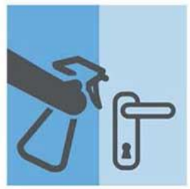
CLEAN AND DISINFECT "HIGH-TOUCH" SURFACES OFTEN