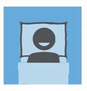
GET ADEQUATE SLEEP AND EAT WELL-BALANCED MEALS