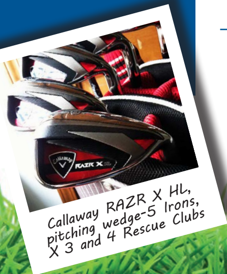
Callaway RAZR X HL, pitching wedge-5 Irons, X 3 and 4 Rescue Clubs